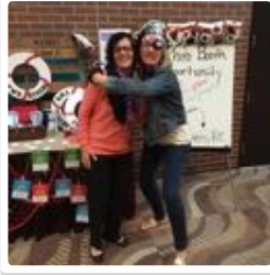
Photo Booth Op

was awarded first place in the Hall of Councils display contest at the Illinois Reading Conference